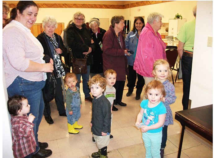
Junior Seniors drop by for lunch on Friday.