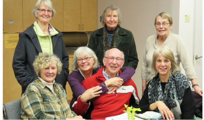
The Syrian Refugee Committee