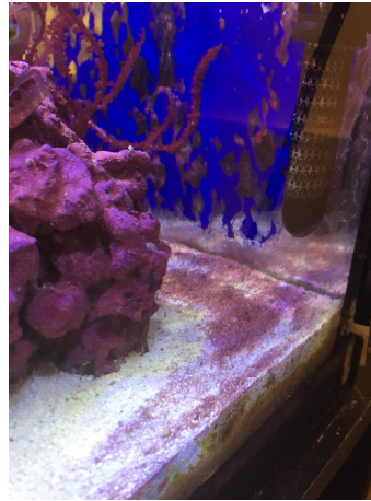
Before with the Cyanobacteria growing on the sand.