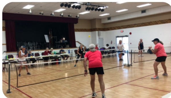
“Dinking” tournament at the SSAC Auditorium