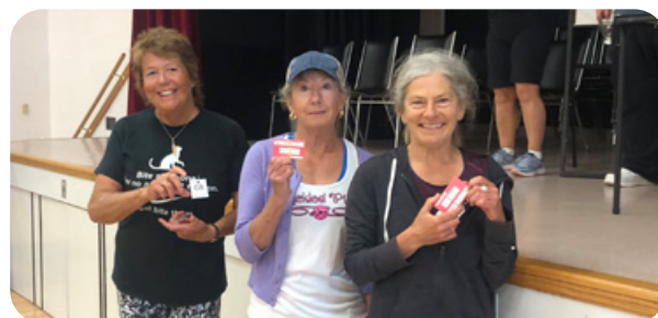
Door prize winners